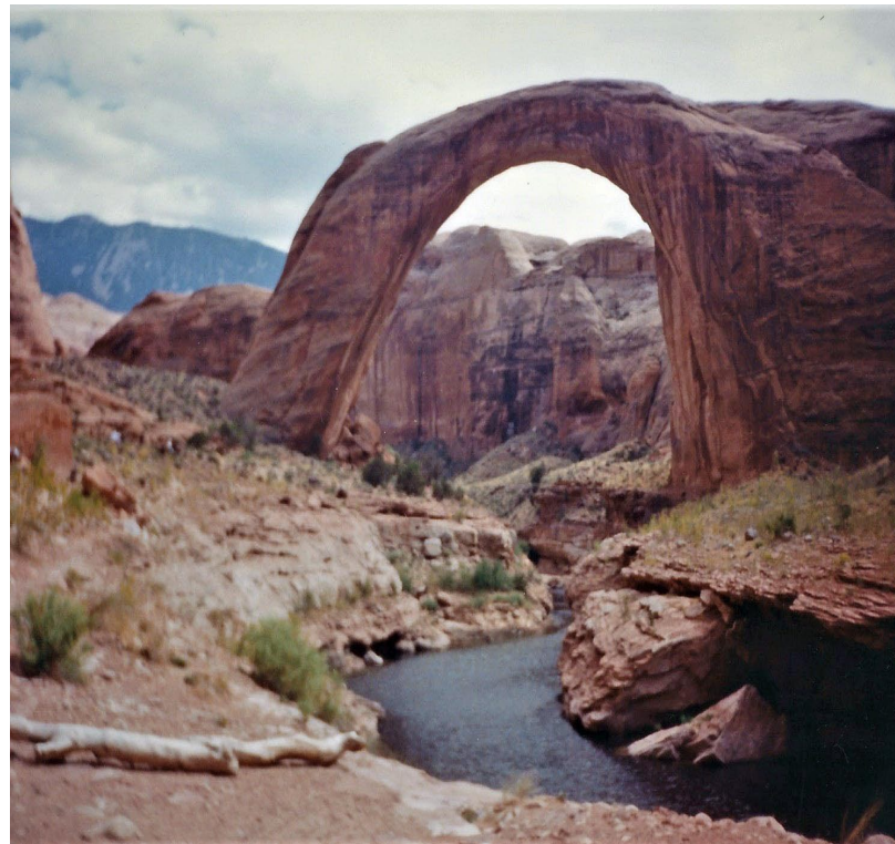
The Power Of God's Hand